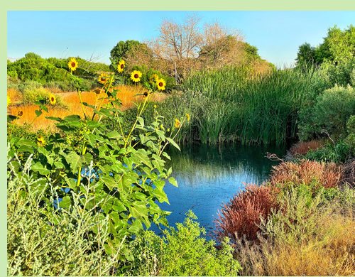
Rio Bosque Wetlands Park